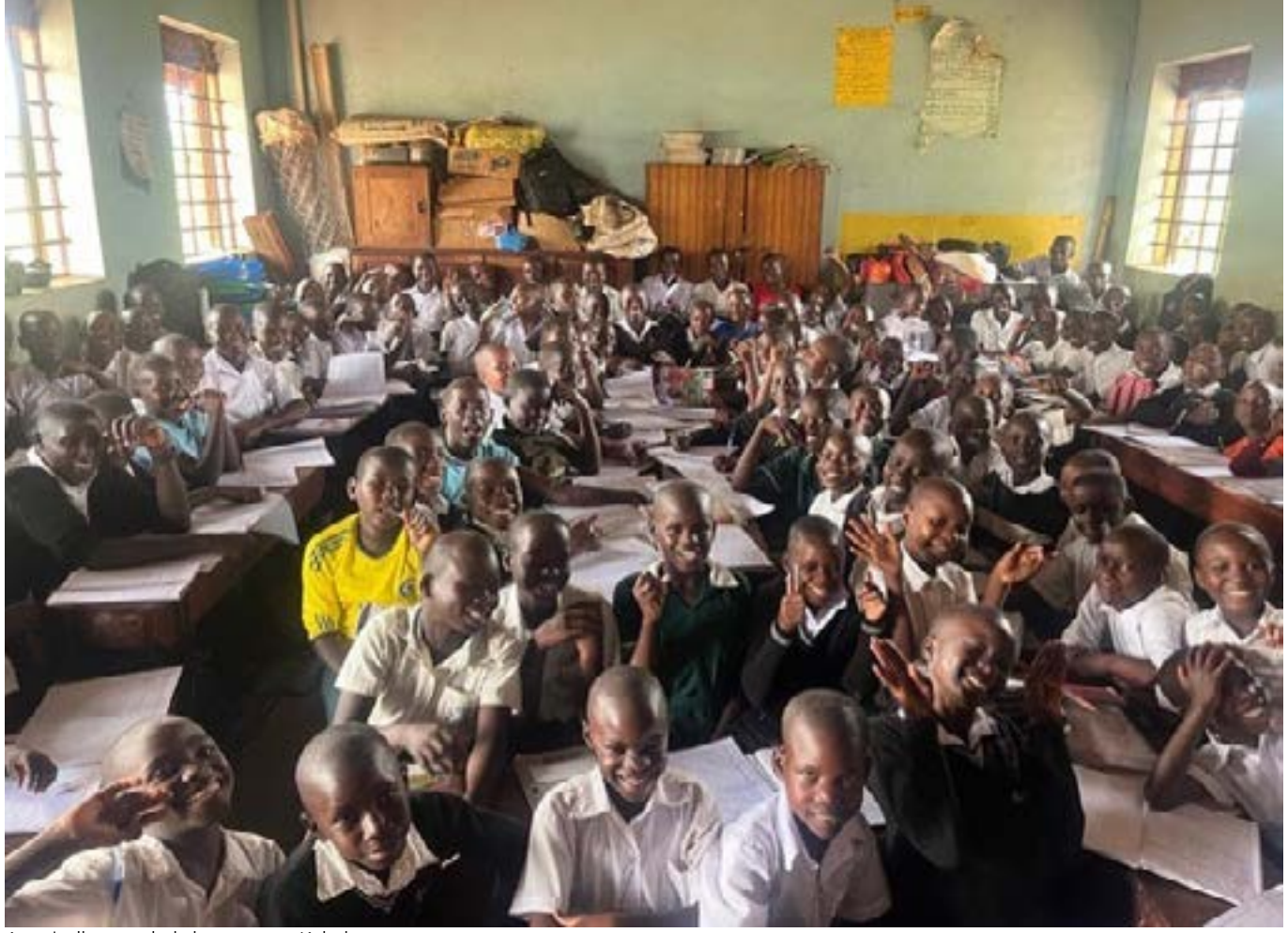
A typically crowded classroom at Kabalega.