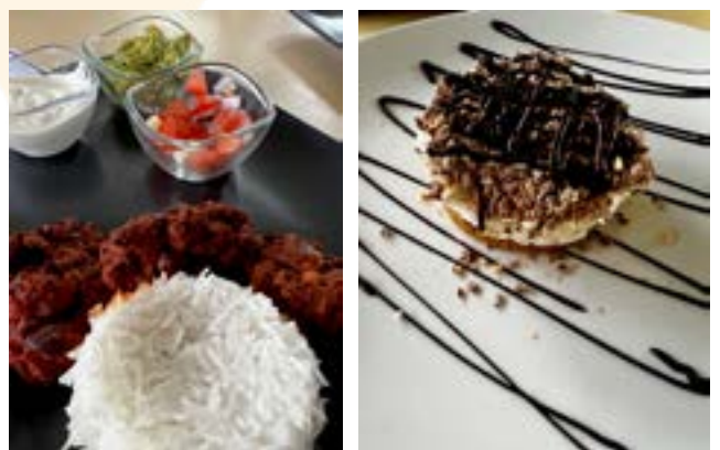
Some of the delicious dishes prepared by the Young Chef competitors