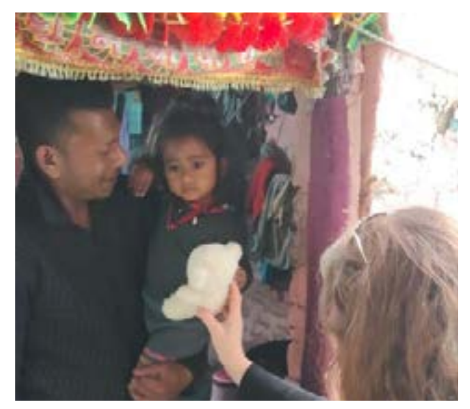
There has not been a case of Polio in India now for 12 years (WHO) but there are still a few cases in Afghanistan and Pakistan so we can't stop our work just yet but we're nearly there in the Global Eradication of Polio.

India's streets are generally much cleaner than even 8 years ago – the streets are hosed, rubbish removed, cow dung cleared and the open sewers are largely covered. It is very rewarding to see the improvements reflected in the number of Polio cases and that the fundraising and hands-on work that Rotarians have done has been worthwhile.