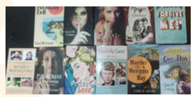
A selection of Carol's books