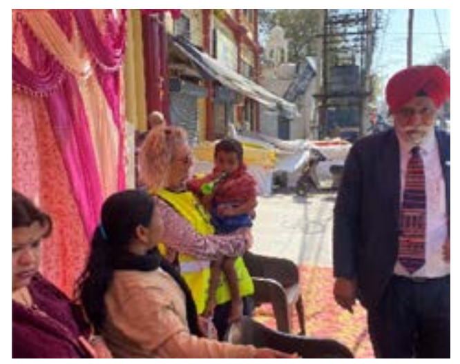
In Amritsar this year, children just trickled along - this was not disappointing, this was great news because most of them had already received their Polio vaccine.

Booths are erected in the streets and in 2010 children thronged to them - not to receive their 'Polio drop' but to receive the little gift that they knew we brought for them! Under 5's would bring babies that had been discarded to the rubbish tips – so that the toddler could also receive the baby's gift.