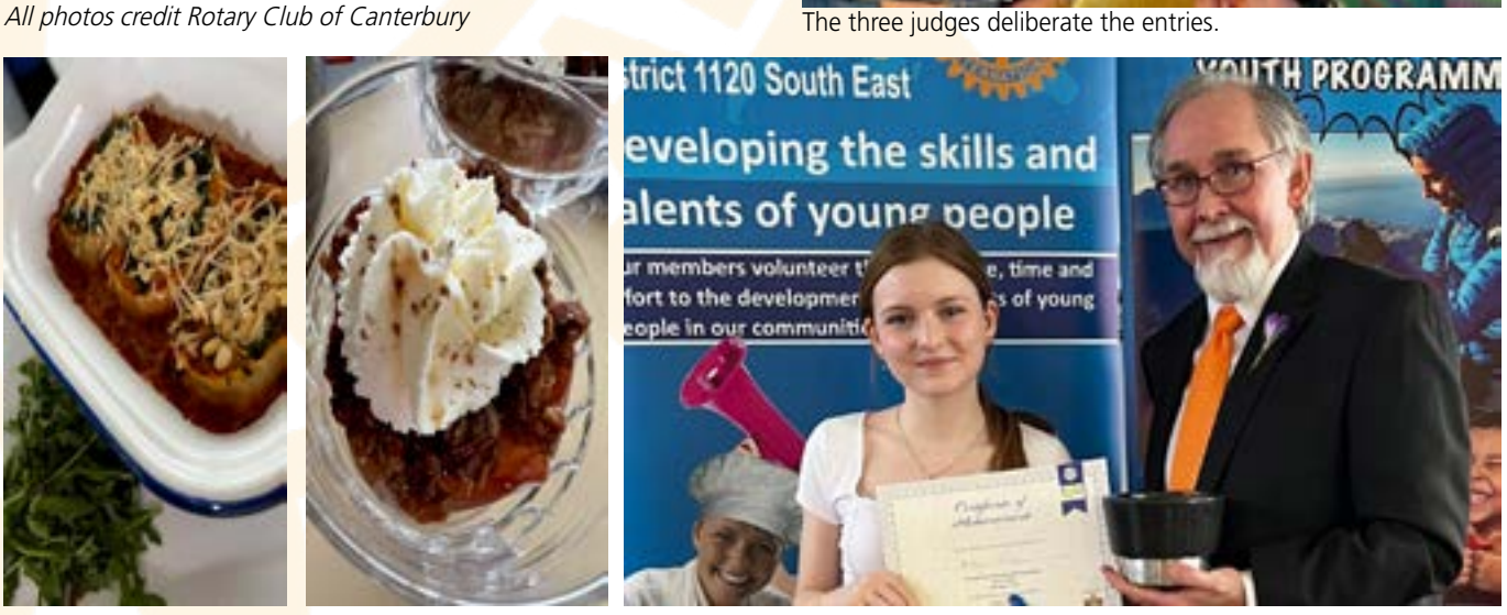
Darcy's winning dishes of butternut squash, spinach, and feta rotolo and baked apple with cream.