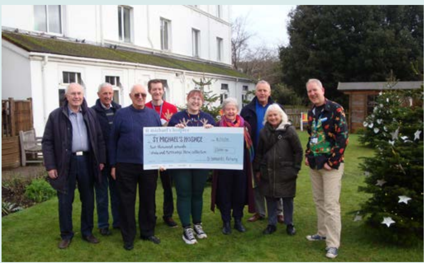
A cheque for £1500 was presented to St Michaels Hospice in St Leonards by the St Leonards Rotary Club.

This money was raised on the cycle challenge in April 2023 and the amount was down quite a lot from other